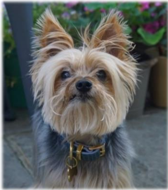
Our dog, Milo Curtis – the resident Yorkshire terrier

I am 13 years old and have no teeth (don't forget to brush yours!). I love meeting new people and am very friendly. Animals are great for young children – they're on the same wavelength! I love helping them to learn compassion and nurturing and while I won't be actually at the nursery – I might join you for a game outside!